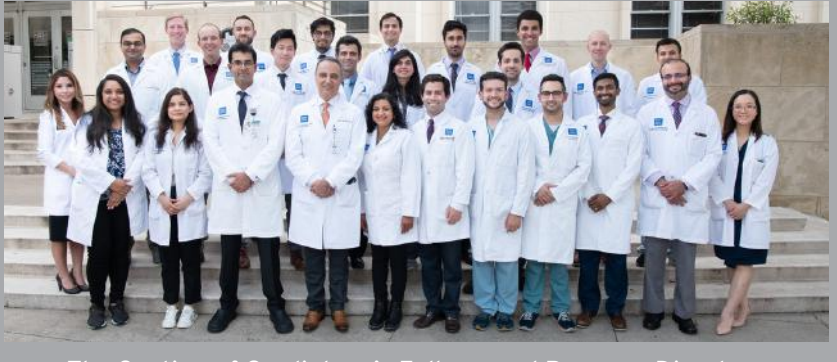
The Section of Cardiology's Fellows and Program Directors