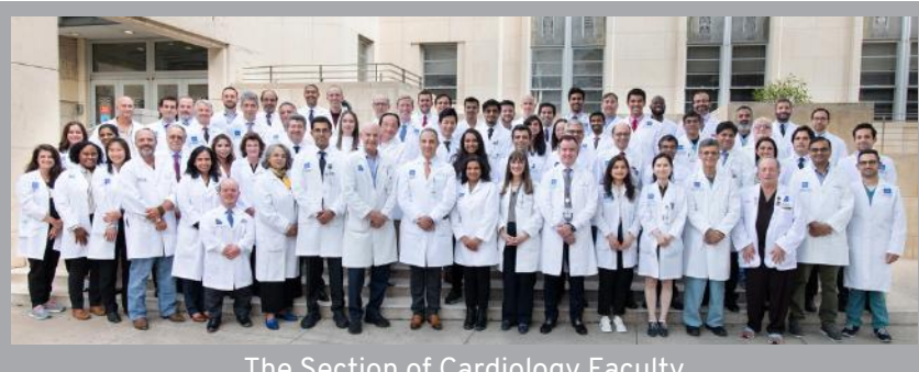
The Section of Cardiology Faculty